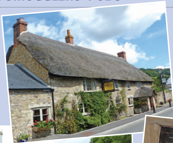
The picture perfect thatched Harbour Inn is a pebble's throw from the Axe Estuary.