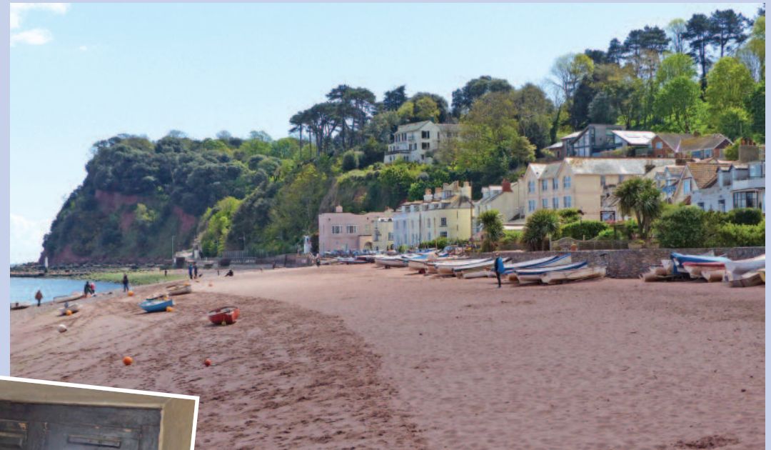
Above: Sheltered beneath the headland of The Ness, Shaldon's red sand beach was a favourite contraband landing site.