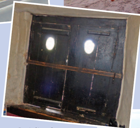
Left: Spy holes in the shutters allowed free trading patrons to keep a lookout for Customs Officers and the Press Gang.